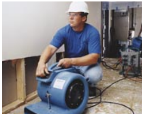
Left, Polygon provides controlled demolition, removing unsalvageable drywall, allowing dry air to reach into wall cavities. Soot, smoke damage and odors are treated, preparing the building to be safely reoccupied.