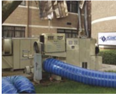
Above, Polygon brings a state-of-the-art dehumidifier to a fire recovery site. Wet, smoke-damaged documents are carefully inventoried and stabilized in preparation for drying and cleaning.

Polygon will see that objects inside the building are not further damaged after a fire by ambient conditions such as high humidity, uncontrolled temperatures, and acidic residue. It will also manage the recovery of documents, including on-site and off-site drying, cleaning and soot